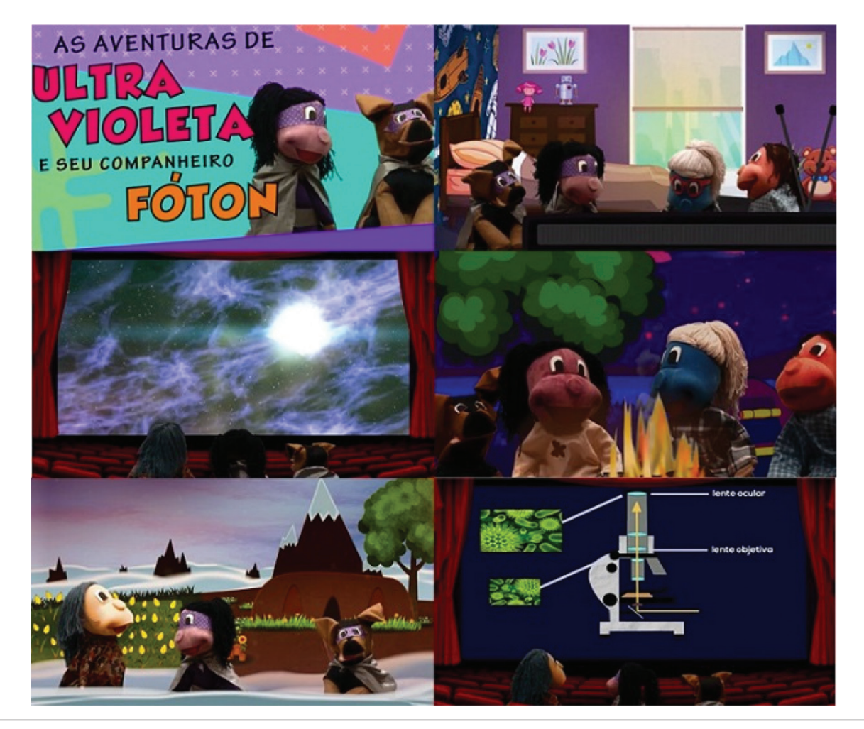
Figure 5. Characters from the series 'The adventures of Ultraviolet and her companion Photon'

web. Currently, the digital platform is undergoing an update and, with the end of the restrictions imposed because of the COVID-19 pandemic, the operation of its 2.0 version should start, with the expansion of the points of interest, taking into account other areas of knowledge (psychology, literature and social sciences). Two new itineraries dedicated to ornithology and music will be implemented in the near future, together with an audio guide.