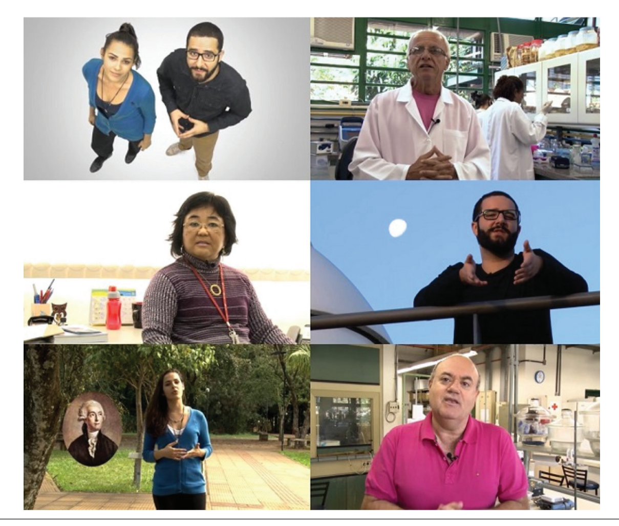
Figure 4. Images from some of the episodes of the Knowledge Paths series, its presenters in the studio and in some of the spaces where points of the museum are located, together with some of the scientists interviewed

(chemiluminescence), biology (photosynthesis), astronomy (life of stars), health (structure and functioning of the eye), physics (decomposition of light) and microscopy (functioning of the microscope). In addition to attention to the quality of the narrative (developed in partnership with specialised screenwriters) and to the accuracy of scientific concepts, there were also pedagogical reflections to consider for the audience for which the production is intended, which resulted, for example, in the adoption of redundancy as a methodological strategy (Pezzo et al., 2018).